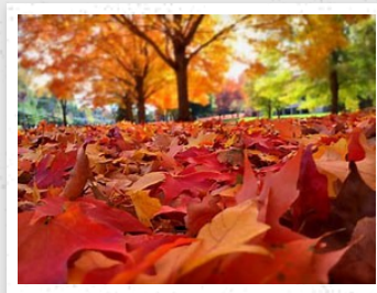
FALL DAYS AND FUN LEAVES