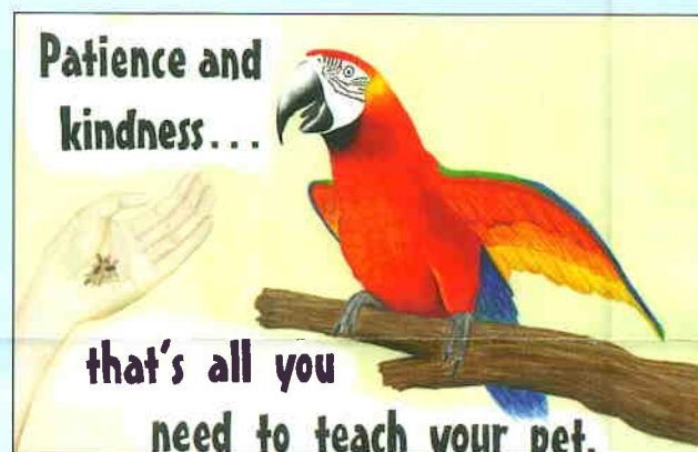
ANNIE PARHAM GRADE 10 CLEVELAND HIGH SCHOOL PORTLAND