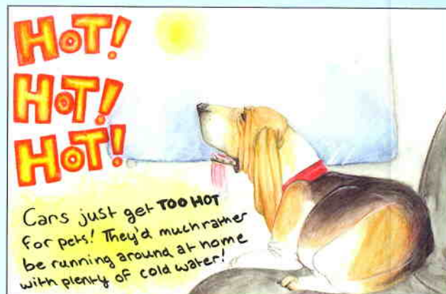
OLIVIA STREB GRADE 9 CATLIN GABEL PORTLAND