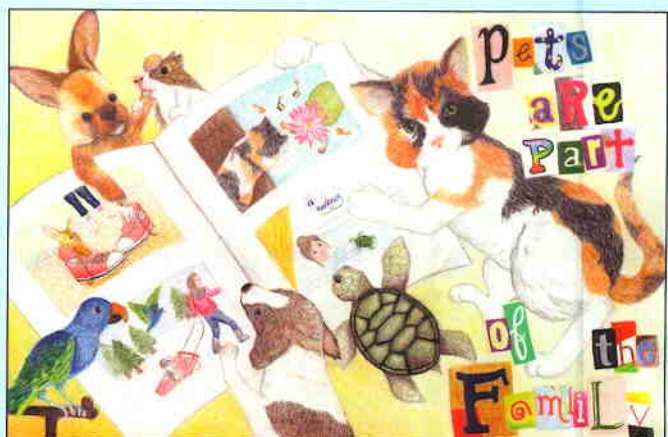
MELISSA LIU GRADE 8 JIAO YING CHINESE CULTURE AND ART SCHOOL PORTLAND