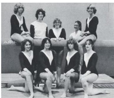
1979 GIRLS GYMNASTICS TEAM