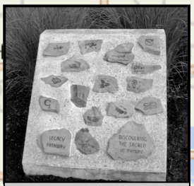
One of the basalt petroglyphs created by Fairview Elementary and Reynolds High School students.

Gray numbered squares denote freeway exits.