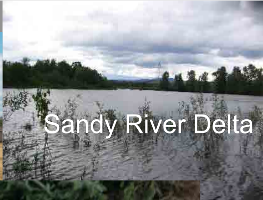
Sandy River Delta