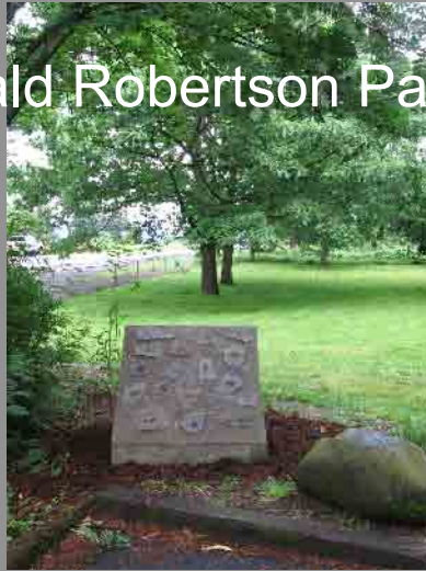
Donald Robertson Park