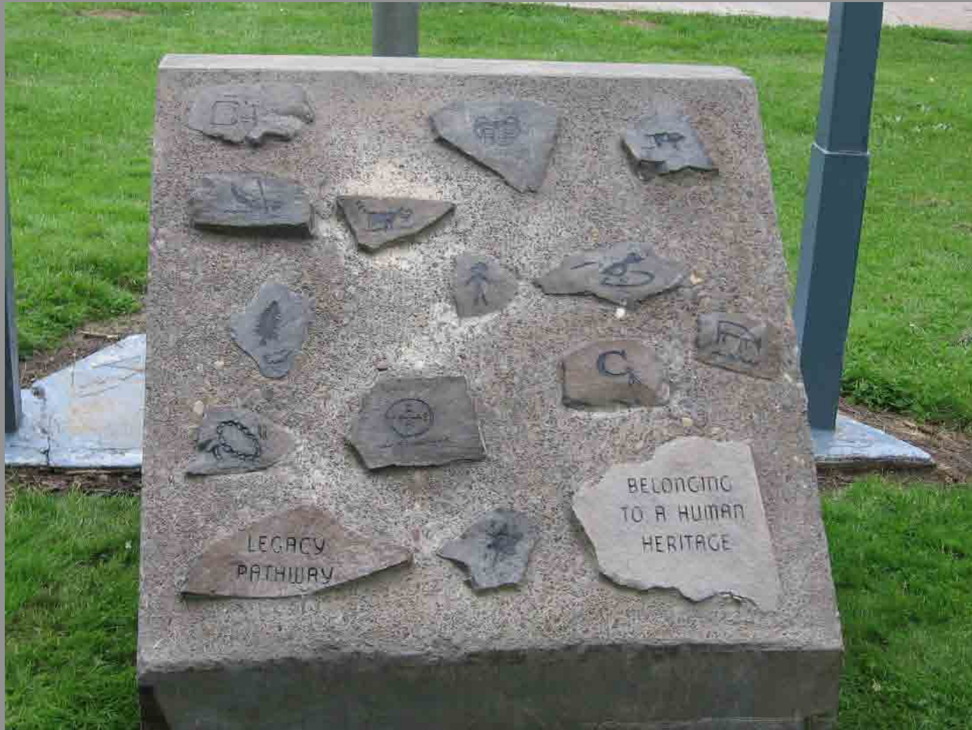
Site # 1 Fairview Elementary School 225 Main Street Fairview, OR 97024 (located near the flag pole)