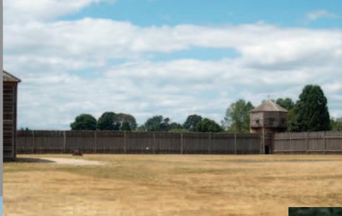
Fort Vancouver Landbridge