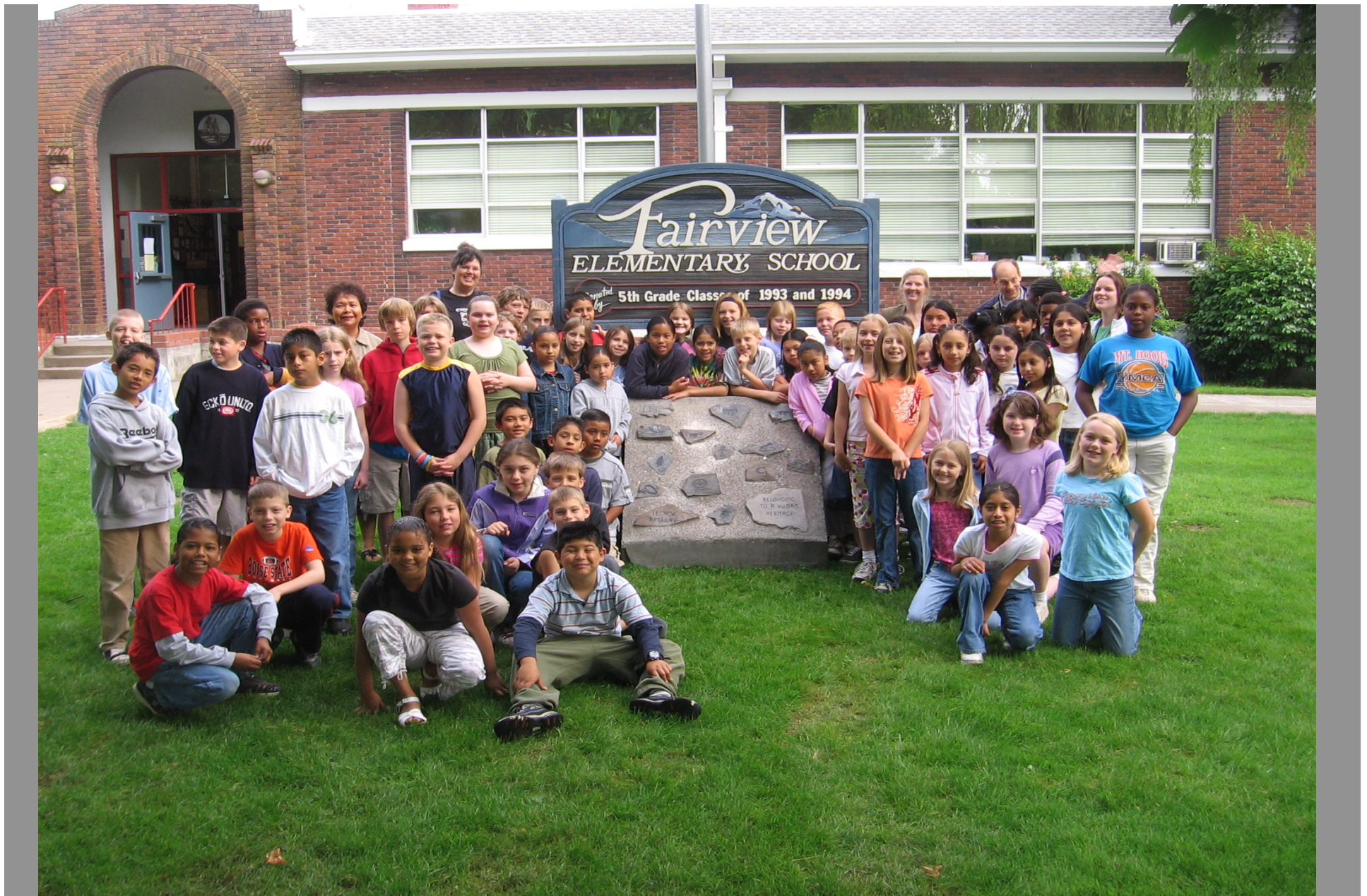
With greatest appreciation from Fairview fourth-graders 2005-2006