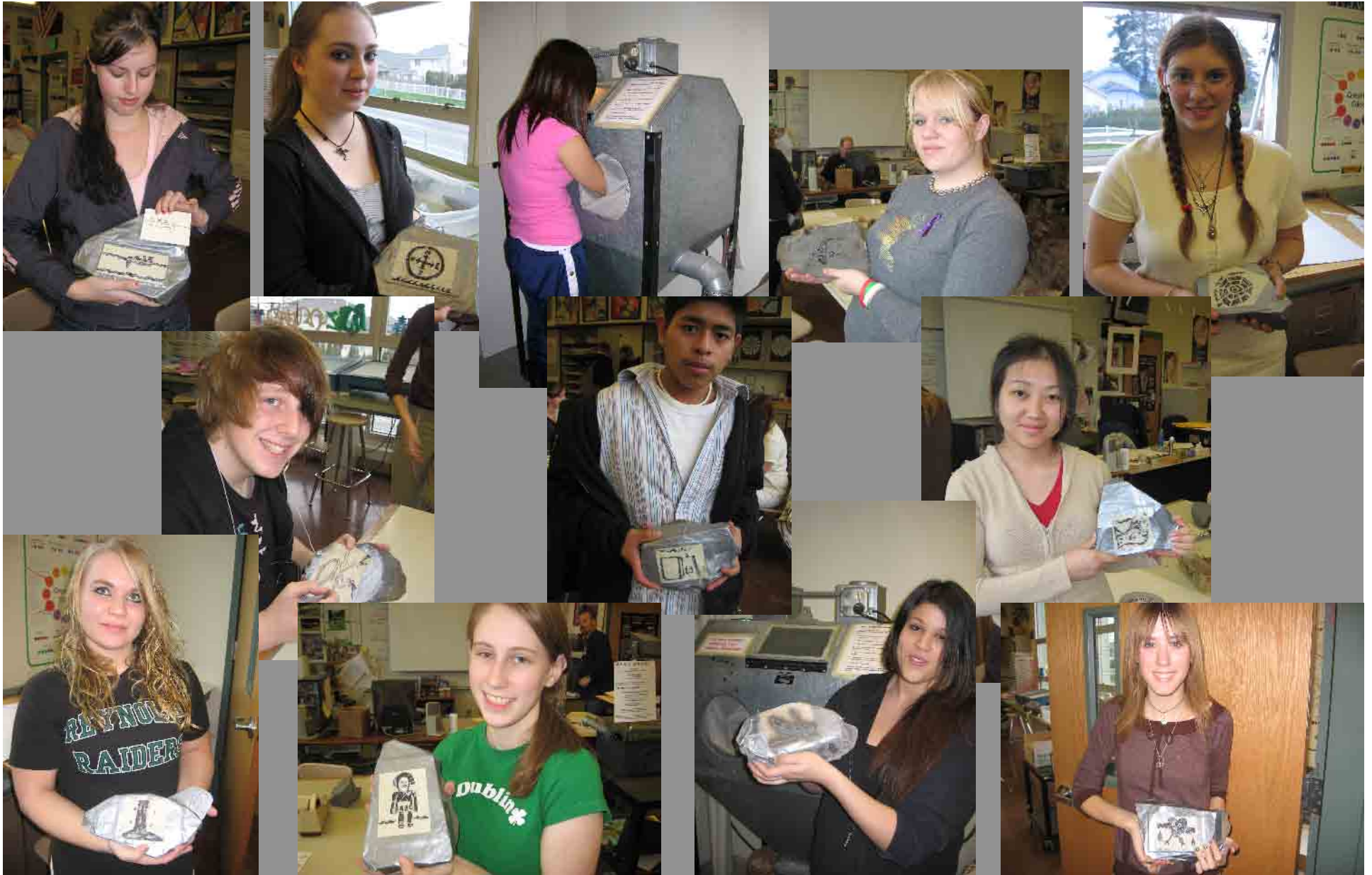
Protecting the remainder of the basalt with tape, RHS students sandblasted the designs into the stones.