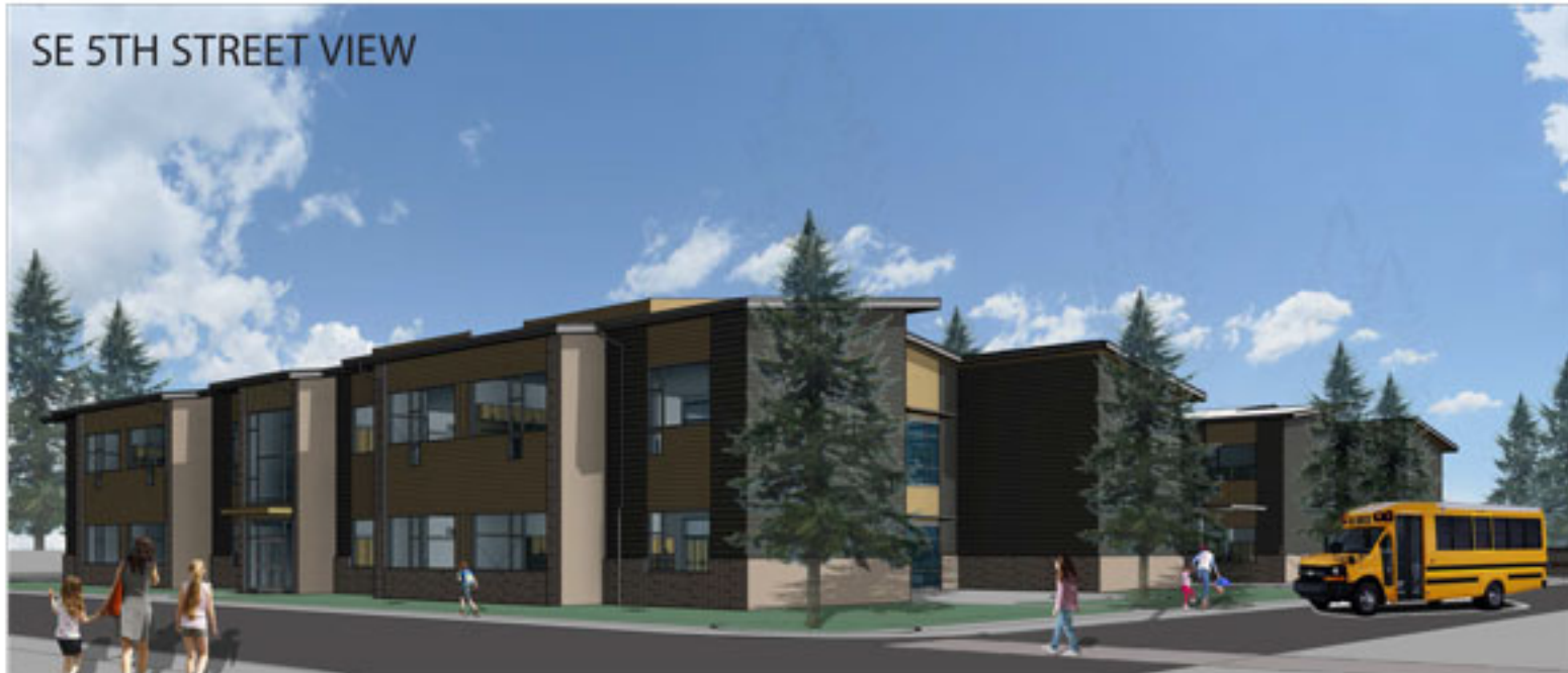
SE 5TH STREET VIEW