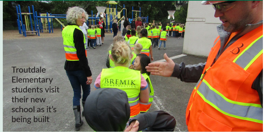
Troutdale Elementary students visit their new school as it's being built

Language interpreters provided. More information on the website or the District office.