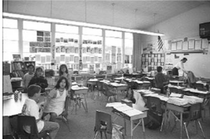
Figure 2—Classroom with window Code 5.

ety of skylight and monitor designs employed. Some designs allowed direct sun into the classrooms while others were diffusing. Some were designed to provide uniform illumination throughout the classroom; others created strong illumination gradients.